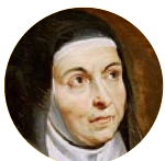
SAINT TERESA OF AVILA

If you took all of the good works done by all of the humans who have ever lived in all of history and stacked them all up and multiplied them by a million, they wouldn't equal the merit, the virtue and the worth of one Mass.